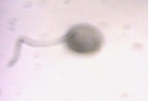
Figure 4. Spores of arbuscular mycorrhizal fungi that dominated on acid dry land.