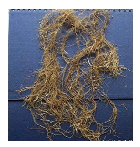
Figure 1. Morphology of the roots soybean plants on acid dry land.

The morphology of the soybean roots in acid dry land and the number of root nodules were a quite low (Figure 1), indicating that Rhizobium bacteria were less able to grow and to form root nodules of soybean in acid dry land. Rhizobium was generally regarded as microbial symbiotic partners of legumes and mainly known for the role in the formation of nitrogen-fixing nodules (Antoun and