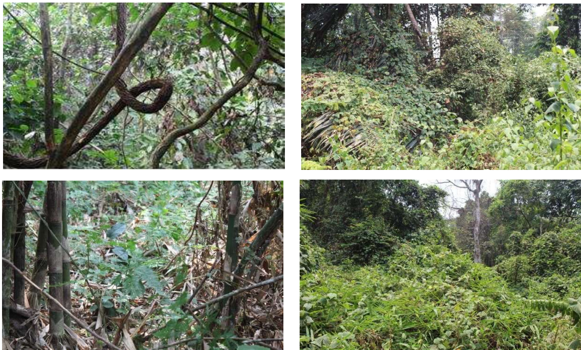
Figure 2. Actual condition of the study area.

Analysis of the data used is the method of comparing (Matching) the characteristics of the land with the conditions for plant growth. The results of the comparison (matching) will then be classified into highly suitable (S1), Medium Suitable (S2), marginally suitable (S3), and not suitable (N), with the lowest value as a limiting factor for land suitability