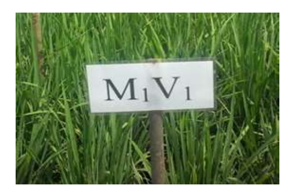
Figure 2. Rice plants fertilized with 300 Kg NPK ha<sup>-1</sup> +150 kg Urea ha<sup>-1</sup> + 4 L BF ha<sup>-1</sup>.

Table 3 shows that, the rice plants fertilized with 225 kg NPK ha<sup>-1</sup> + 112.5 kg/ha<sup>-1</sup> of Urea + 4 L of BF ha<sup>-1</sup>, 300 kg ha<sup>-1</sup> of NPK + 150 kg ha<sup>-1</sup> of Urea + 4 L of BF ha<sup>-1</sup>, and only 4 L of BF ha<sup>-1</sup> resulted in more paddy yields. The results were noticeably different from the other four fertilizer treatments in the Mekongga variety. In the Mekongga variety, treatment with 300 kg NPK ha<sup>-1</sup> + 150 kg Urea ha<sup>-1</sup> + 4 L BF ha<sup>-1</sup>, and 4 L BF ha<sup>-1</sup> increased paddy yields by 10.46%, 30.33%, and 64.08%, respectively, when compared to only 4 L BF ha<sup>-1</sup>, only inorganic fertilizers, and the control group, respectively. The same