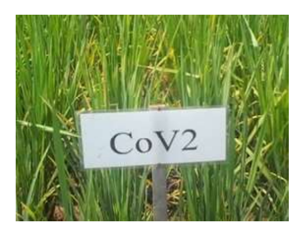
Figure 4. Unfertilized rice plants (Control).