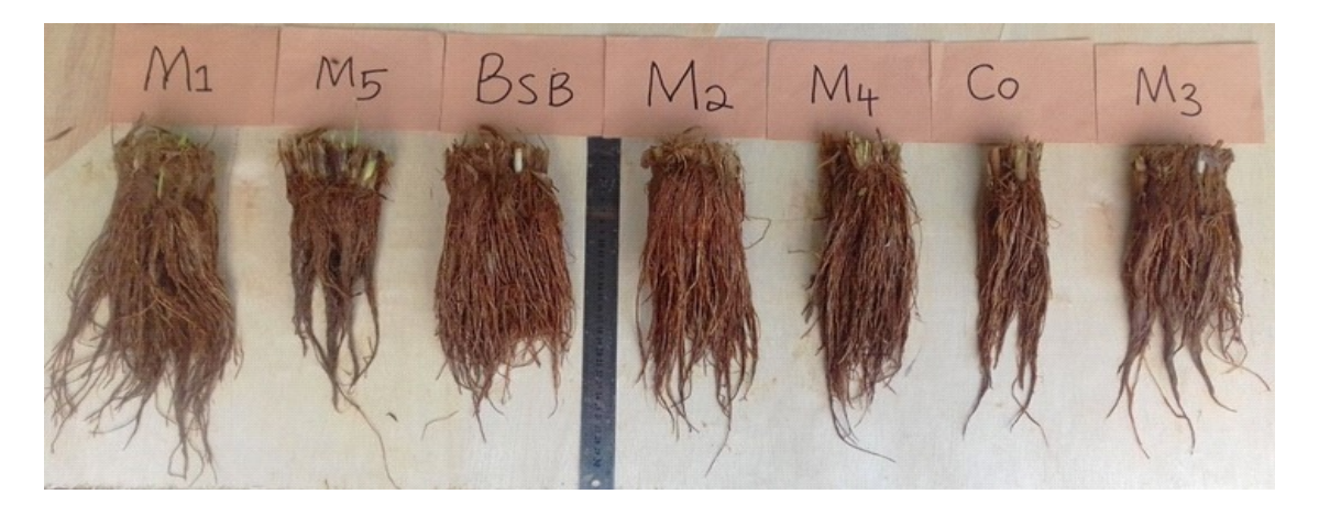
Figure 1. Roots of rice plants after harvest. M1 represents roots under fertilization of 300 kg NPK ha<sup>-1</sup> + 150 kg Urea ha<sup>-1</sup> + 4 L BF ha<sup>-1</sup>. M5 represents 300 kg NPK ha<sup>-1</sup> + 150 kg Urea ha<sup>-1</sup>. BSB represents only 4 L BF ha<sup>-1</sup>. M2 represents 150 kg NPK ha<sup>-1</sup> + 75 kg Urea ha<sup>-1</sup> + 4 L BF ha<sup>-1</sup>. M4 represents 225 kg NPK ha<sup>-1</sup> + 112.5 kg Urea ha<sup>-1</sup> + 4 L BF ha<sup>-1</sup>. Co represents Control group or unfertilized rice roots. M3 represents 75 kg NPK ha<sup>-1</sup> + 37.5 kg Urea ha<sup>-1</sup> + 4 L BF ha<sup>-1</sup>.

and 5). This condition was influenced by the nitrogen nutrients from the applied fertilizers and the ability of Bacillus sp. to fix N, in the soil. Nitrogen is a crucial component of chlorophyll, the green pigment used in photosynthesis, primarily enhancing the absorption of solar light energy. Moreover, by increasing crop yields, nitrogen plays a vital role in agriculture (Leghari et al., 2016). Consequently, the overall effects of BF and inorganic fertilizers were positive, as the roots' absorption of nutrients from the soil resulted in highly productive tillers. Danuwikarsa and Robana (2017) also reported enhanced productive tillers due to biofertilizer applications for rice plant growth. The respective levels of productive tillers varied significantly among the varieties. Concerning productive tillers, the Mekongga variety exhibited an 18.4% advantage