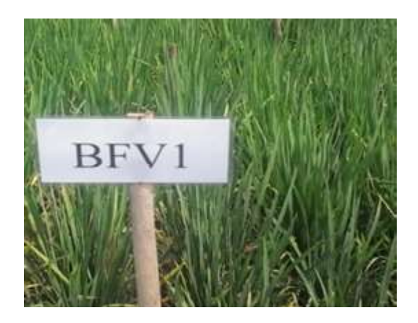
Figure 5. Rice plants applied with only Bacillus sp. biofertilizer.

Despite reducing inorganic fertilizers by 75% and 50% in the latter two fertilizer treatments compared to applying 100% of the recommended chemical fertilizer rates, no significant difference in paddy yields was observed. This indicates that the Bacillus sp. biofertilizer effectively improved nutrient availability through phosphate solubilization and nitrogen fixation (Islam et al., 2012). However, pretransplanting soil properties demonstrated a high level of organic matter, enabling the added Bacillus bacteria to function effectively in mineralization (Ishak and Brown, 2019). Our findings indicate that applying only 4 liters of BF per hectare resulted in a 17.2% increase in paddy grain yield compared to rice plants treated with 300 kilograms of NPK per hectare and 150 kilograms of urea per hectare in the Mekongga variety. This significant yield increase can be attributed to the extensive root growth observed in all BF treatments, enabling rice plant roots to absorb substantial nutrients from the soil. The enhanced root