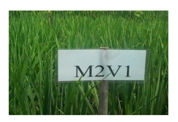
Figure 3. Rice plants fertilized with 225 kg NPK ha<sup>-1</sup> + 112.5 kg Urea ha<sup>-1</sup> + 4 L BF ha<sup>-1</sup>